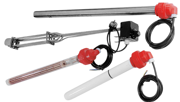
Example of product design